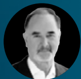
Dr. Ing. e.h. Dipl.-Ing. Bernd Pischetsrieder