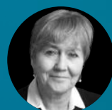
Dame Polly Courtice