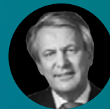
Ben van Beurden